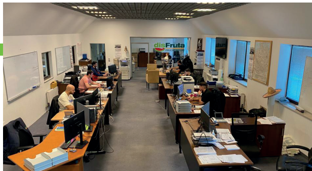
Sales throughout Europe